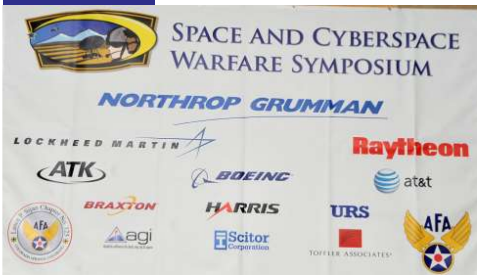
Corporate Sponsors of Space and Cyberspace Symposium

Bottom line: The Space and Cyberspace Warfare Symposium is not to be missed and I hope to see you all there next June in Keystone, Colorado.