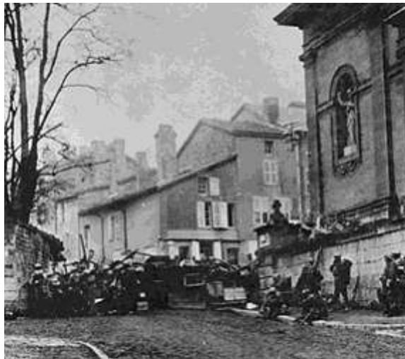
Soldiers of the 353rd Infantry near a church at Stenay, Meuse in France, wait for the end of hostilities. This photo was taken at 10:58 a.m., on November 11, 1918, two minutes before the armistice ending World War I went into effect

World War I – known at the time as “The Great War” - officially ended when the Treaty of Versailles was signed on June 28, 1919, in the Palace of Versailles outside the town of Versailles, France. However, fighting ceased seven months earlier when an armistice, or temporary cessation of hostilities, between the Allied nations and Germany went into effect on the eleventh hour of the eleventh day of the eleventh month. For that reason, November 11, 1918, is generally regarded as the end of “the war to end all wars.”