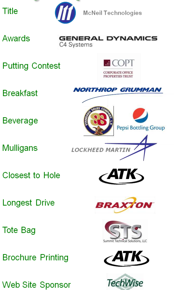
IMAGE 2010 Hole Sponsors