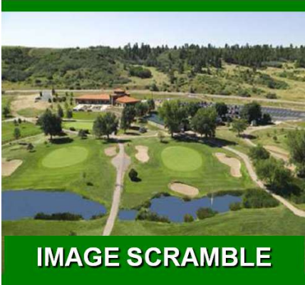
IMAGE 2010 golf tournament, held on 13 Aug 2010 at Ft Carson, was a resounding success. We raised over $30,000 for STEM (Science, Technology, Engineering, & Math) scholarships to be divided among AFA,