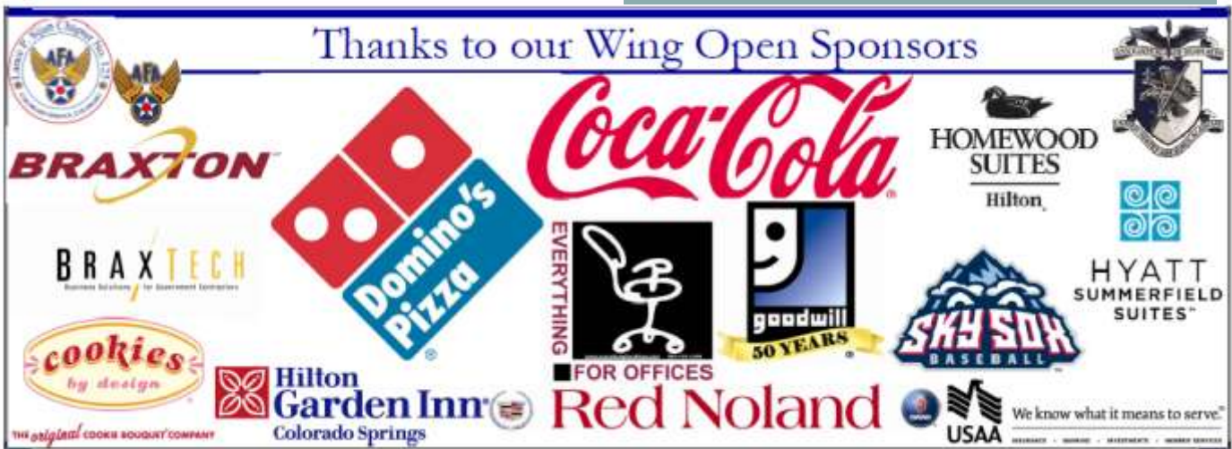
Banner show-casing Sponsors of the Pizza Party Fund Raiser