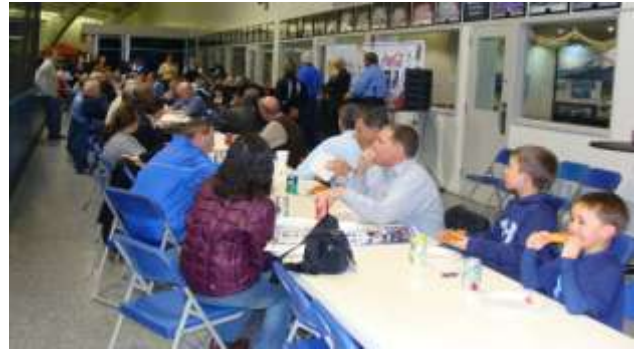
Supporters of the Pizza Party Fund Raiser enjoying Dominos Pizza and Coca-Cola .

The AFA Sijan Chapter 125 is honored and proud to assist with the fund rising at such a fun, important and prestigious event.